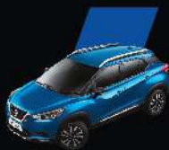
Deep Blue Pearl