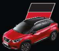
Fire Red & Onyx Black