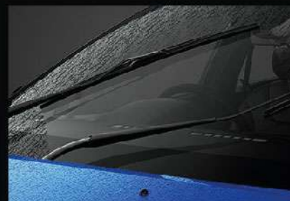
RAIN SENSING WIPERS