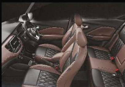
LEATHER SEATS LEATHER WRAPPED DASHBOARD