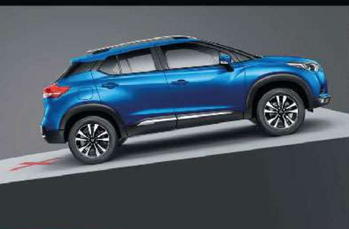
HILL START ASSIST (HSA)