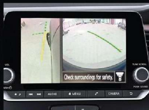
FRONT/REAR & SIDE VIEW