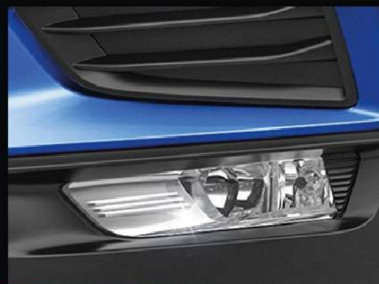
FRONT FOG LAMPS WITH CORNERING FUNCTION