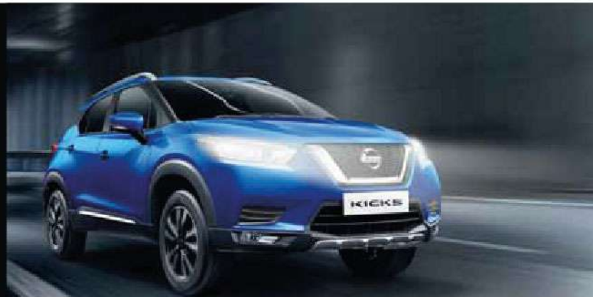
AUTOMATIC LED PROJECTOR HEADLAMPS (DUAL CHAMBER FOR BETTER VISIBILITY)

SMARTPHONE CONNECTIVITY - APPLE CARPLAY & ANDROID AUTO VOICE RECOGNITION (SIRI & OK GOOGLE ASSISTANT)