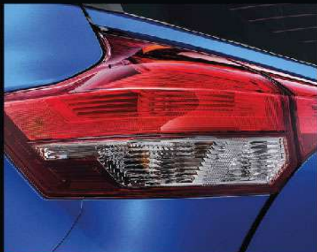
BOOMERANG TAIL LAMPS