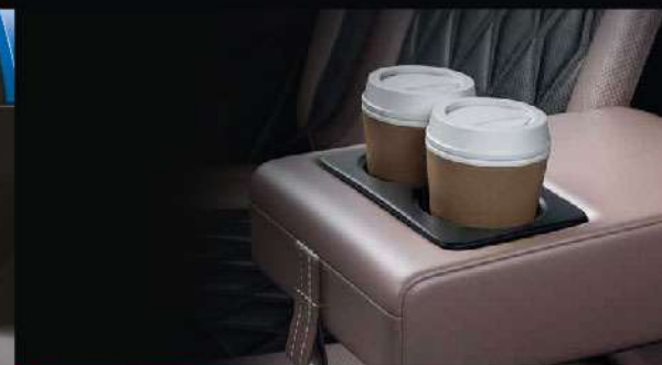
REAR SEAT ARMREST WITH CUP HOLDERS