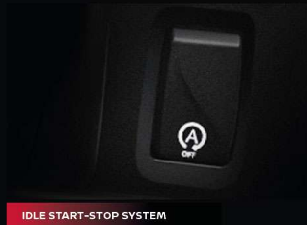
IDLE START-STOP SYSTEM