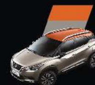
Bronze Grey & Amber Orange