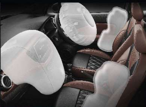
FRONT DUAL & SIDE SEAT AIRBAGS