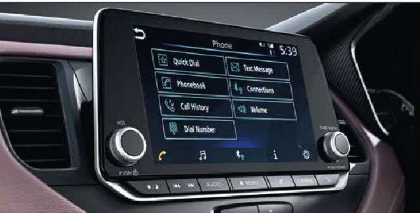
FIRST-IN-CLASS FLOATING 8.0 A-IVI TOUCHSCREEN WITH SPEED SENSING AUTO VOLUME CONTROL

SMARTPHONE CONNECTIVITY - APPLE CARPLAY & ANDROID AUTO VOICE RECOGNITION (SIRI & OK GOOGLE ASSISTANT)