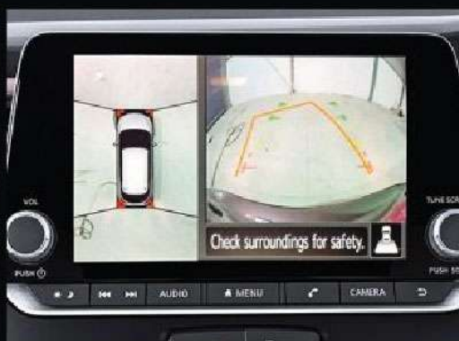
BIRD'S EYE & REAR VIEW