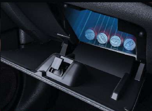
COOLING GLOVE BOX WITH ILLUMINATION