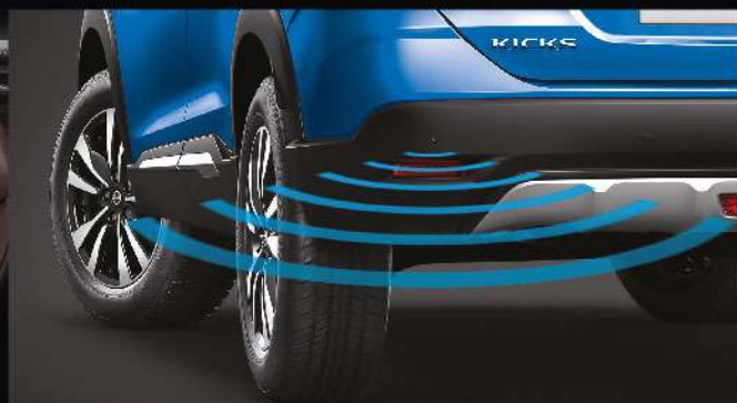
REAR PARKING SENSORS WITH CAMERA