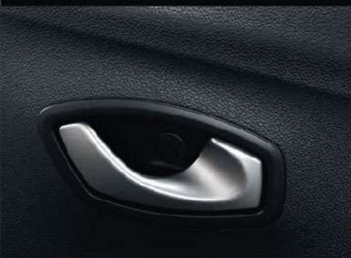
SPEED SENSING DOOR LOCK