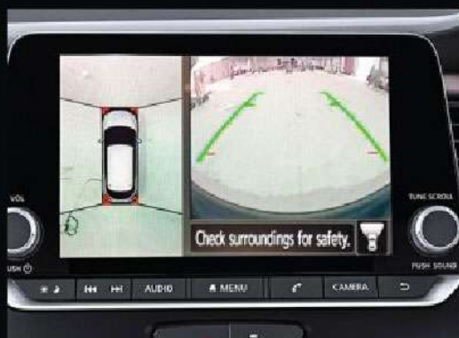
360° BIRD'S EYE VIEW