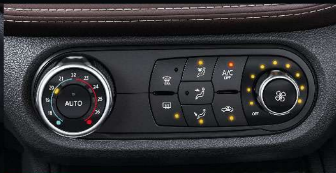
FIRST-IN-CLASS AUTOMATIC CLIMATE CONTROL (STANDARD)