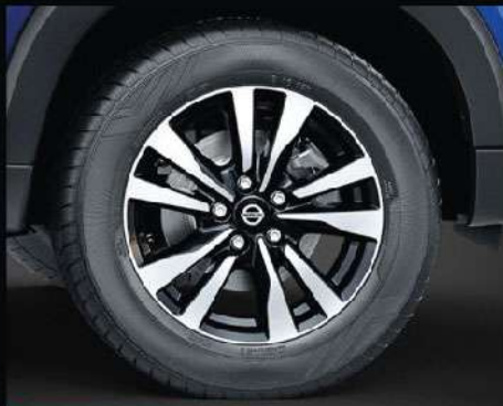
R17 5-SPOKE MACHINED ALLOY WHEELS