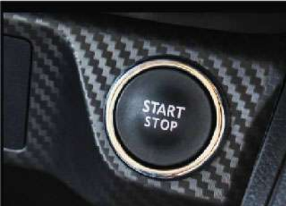
PUSH BUTTON START / STOP