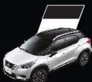
Pearl White & Onyx Black