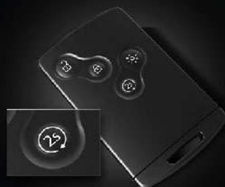
FIRST-IN-CLASS REMOTE ENGINE START