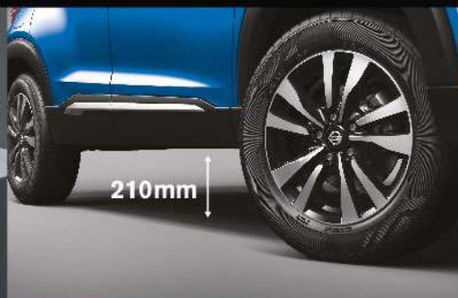
BEST-IN-CLASS GROUND CLEARANCE (210mm)